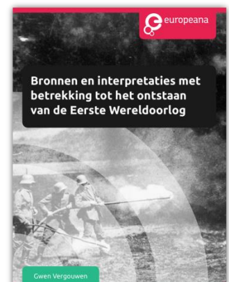
Multi-Touch Book and iTunes U course World War I: A battle of perspectives