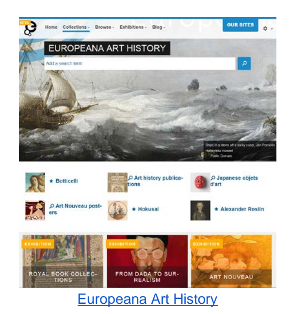
With the launch of the new Europeana Collections website in December, we also beta launched the first two thematic collections: Art History and Music (in collaboration with Europeana Sounds). During this phase, we were actively seeking user feedback before the launch campaigns started in the period March- December 2016 when we wanted to build up community.