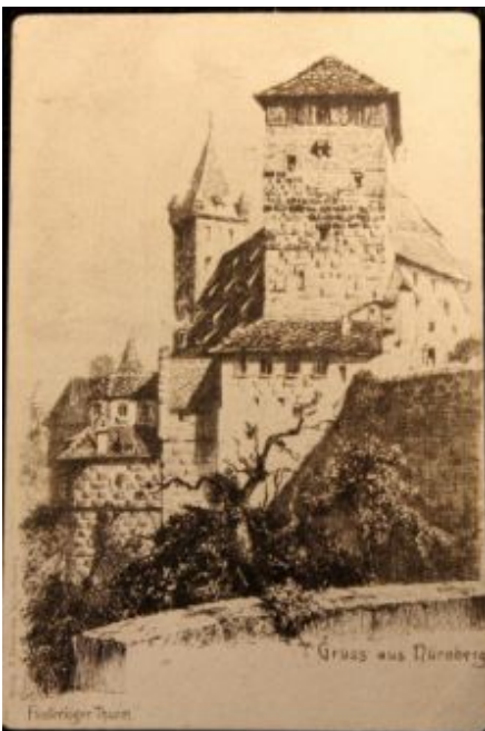
The postcard was sent in 1916

In the card Hitler misspells the German word for 'immediately' as 'soffort' instead of 'sofort'.