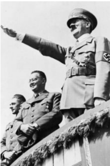
Adolf Hitler pictured in 1938

'We know from other sources he disliked the sentiment on the home front, where the war was being increasingly criticised, and what he wants is to return to his surrogate family on the front line.'