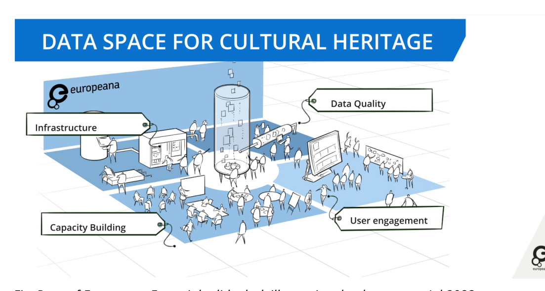
Fig: Page of Europeana Essentials slide deck illustrating the data space, Jul 2023

A new slidedeck focussing on the concept of the common European data space for cultural heritage has been integrated into the suite of Europeana Essentials slide decks<sup>16</sup> on Europeana Pro, to provide audiences with another resource for communication.