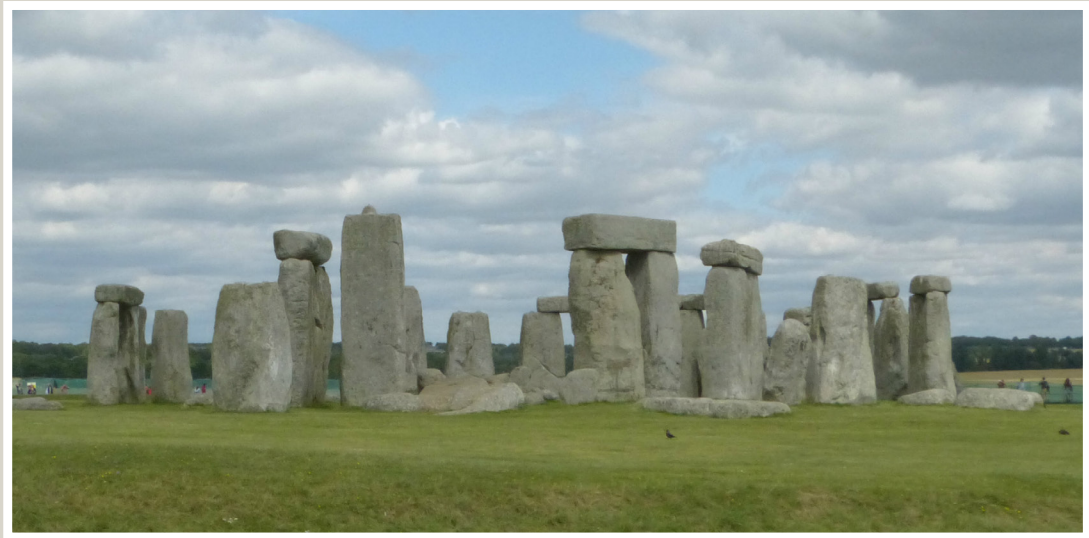
View of Stonehenge, 2Culture, CC BY

71.6% of the 5,042,078 objects in Europeana provided by The United Kingdom are openly licensed . 0.6% of these objects are shown with the internationally accredited Public Domain mark , 0.1% is licensed under CC BY-SA , 62.4% is licensed under CC BY and 8.5% is licensed under CC0 .