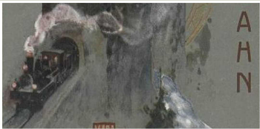
The Rhaetian Railway, with particular attention to the Albula route

61.2% of the 62,141 objects in Europeana provided by Switzerland are openly licensed . All of these objects are licensed under CC BY-SA .