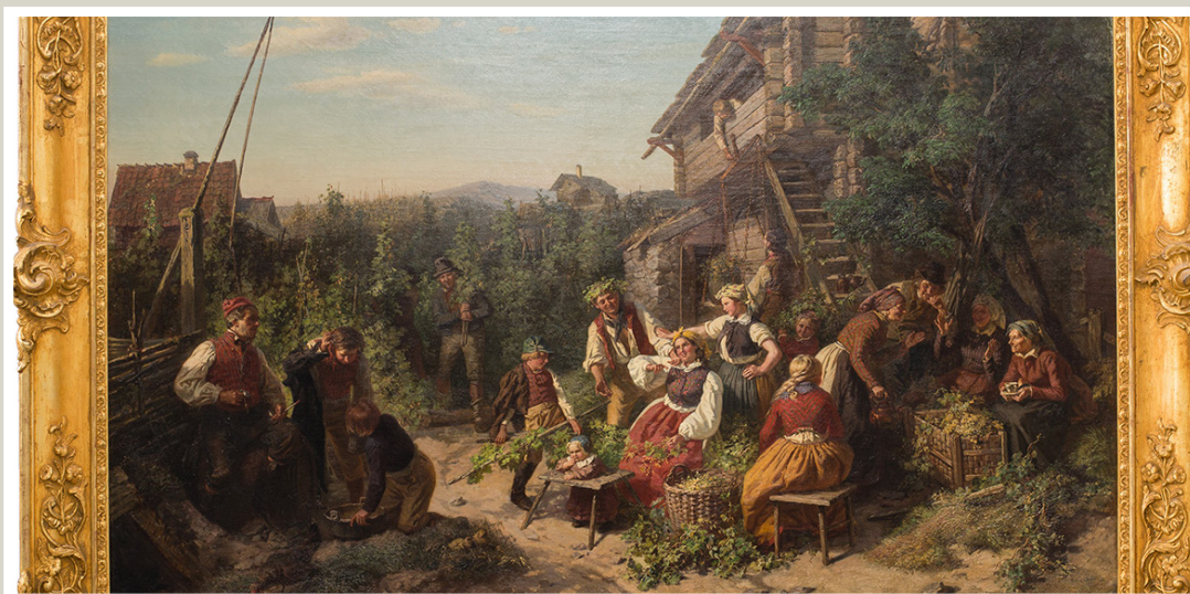
Humleskörd i Askarboda, Österåker, oljemålning av Josef Wilhelm Wallander 1856, Sörmlands museum, CC BY-SA

71.5% of the 4,636,211 objects in Europeana provided by Sweden are openly licensed . 29.2% of these objects are shown with the internationally accredited Public Domain mark , 6.7% is licensed under CC BY-SA , 8.3% is licensed under CC BY and 27.3% is licensed under CC0 .