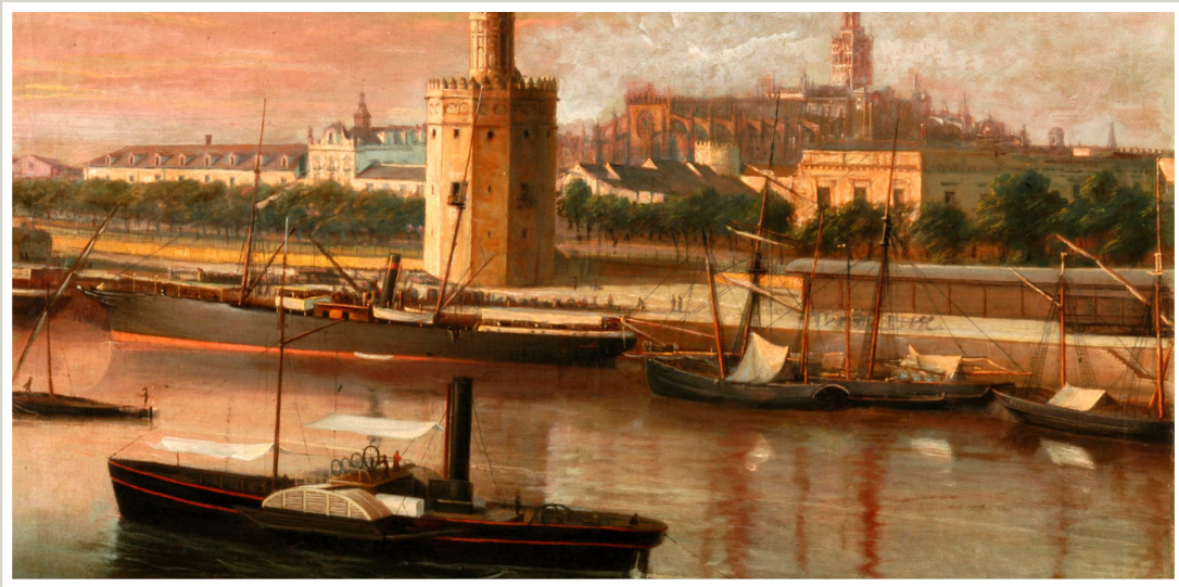
Vista de la Torre del Oro desde Triana. Pintura, Biblioteca Virtual del Ministerio de Defensa, CC0

45.8% of the 4,891,646 objects in Europeana provided by Spain are openly licensed . 10.8% of these objects are shown with the internationally accredited Public Domain mark , 0.5% is licensed under CC BY-SA , 31.4% is licensed under CC BY and 3.1% is licensed under CC0