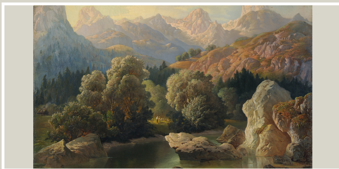
Triglav iz Bohinja, Narodna galerija, Ljubljana / National Gallery of Slovenia, CC BY-SA

44% of the 471,327 objects in Europeana provided by Slovenia are openly licensed . 43.7% of these objects are shown with the internationally accredited Public Domain mark and 0.3% is licensed under CC BY-SA .