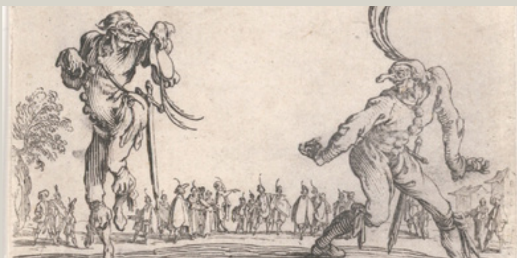
Bonbardon a Grillo | Jacques Callot, Slovak National Gallery, Public Domain

80.3% of the 17,473 objects in Europeana provided by Slovakia are openly licensed . 43.6% of these objects are shown with the internationally accredited Public Domain mark and 36.6% is licensed under CC0 .