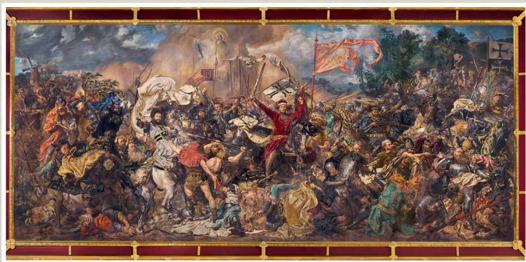
Battle of Grunwald, Muzeum Narodowe w Warszawie, Public Domain

64.4% of the 3,650,418 objects in Europeana provided by Poland are openly licensed . 64.1% of these objects are shown with the internationally accredited Public Domain mark , 0.1% is licensed under CC BY-SA and 0.2% is licensed under CC BY .