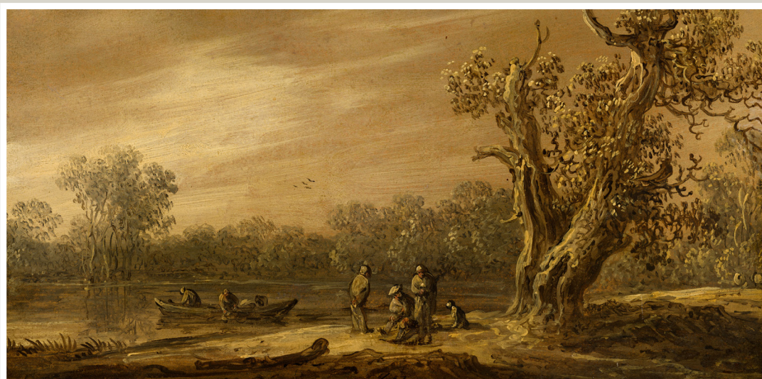
Vissers aan de oevers van een plas, Mauritshuis, Public Domain

80.4% of the 9,554,147 objects in Europeana provided by The Netherlands are openly licensed . 14.9% of these objects are shown with the internationally accredited Public Domain mark , 11% is licensed under CC BY-SA , 2.1% is licensed under CC BY and 48.6% is licensed under CC0 .