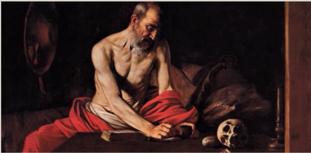
St Jerome | Michaelangelo Merisi da Caravaggio, St. John's Co-Cathedral Foundation, CC0

0.1% of the 51,047 objects in Europeana provided by Malta are openly licensed . All of these objects are shown with the internationally accredited Public Domain mark .