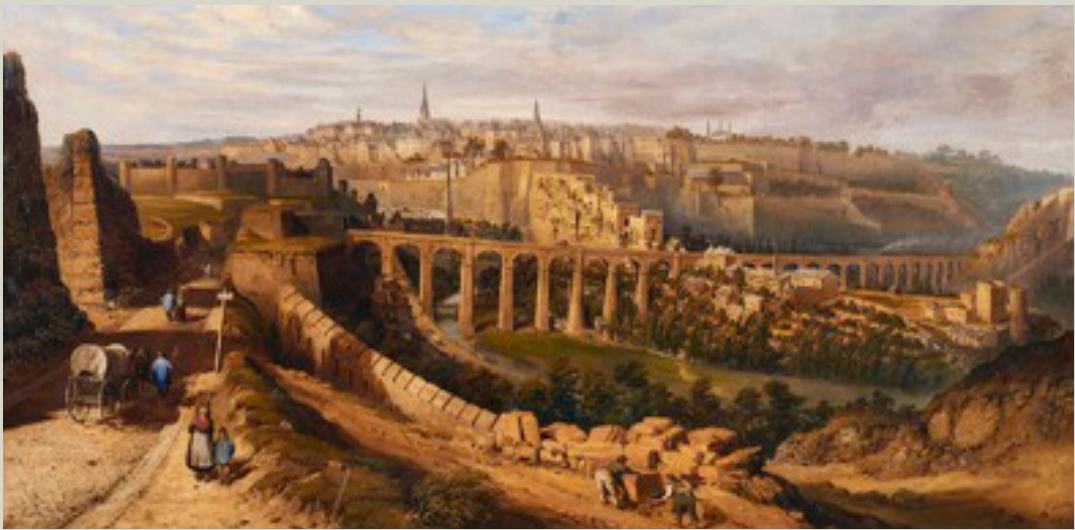
Vue de la ville de Luxembourg depuis le Fetschenhof | Nicolas Liez

41.5% of the 65,794 objects in Europeana provided by Luxembourg are openly licensed . All of these objects are shown with the internationally accredited Public Domain mark .