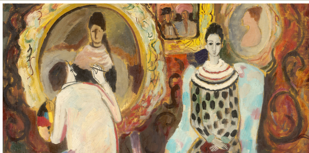
Woman with the Artist, Lithuanian Art Museum, CC BY

47.7% of the 633,922 objects in Europeana.eu provided by Lithuania are openly licensed . 42.1% of these objects are shown with the internationally accredited Public Domain mark , 1.3% is licensed under CC BY-SA and 1.4% is licensed under CC BY .