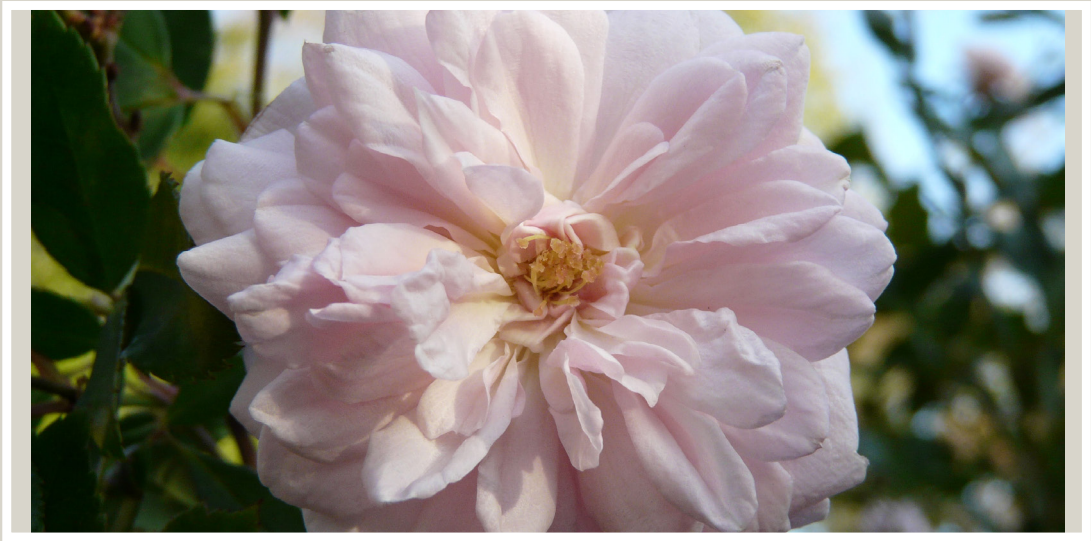
Rosa 'Bloomfield Abundance'

11.9% of the 1,812,325 objects in Europeana provided by Italy are openly licensed . 1.2% of these objects are shown with the internationally accredited Public Domain mark , 7.3% is licensed under CC BY-SA , 2.9% is licensed under CC BY and 0.5% is licensed under CC0 .