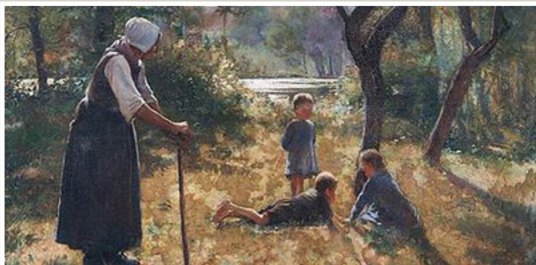
Time Flies, Crawford Gallery, Public Domain Marked

6.7% of the 117,291 objects in Europeana provided by Ireland are openly licensed . 3.2% of these objects are shown with the internationally accredited Public Domain mark , 1.7% is licensed under CC BY-SA , 1.5% is licensed under CC BY and 0.3% is licensed under CC0 .