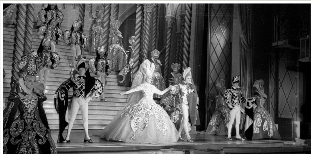
Színházi előadás, Fortepan, CC BY-SA

6.2% of the 624,027 objects in Europeana provided by Hungary are openly licensed . 5% of these objects are shown with the internationally accredited Public Domain mark , 0.3% is licensed under CC BY-SA , 0.8% is licensed under CC BY and 0.1% is licensed under CC0 .