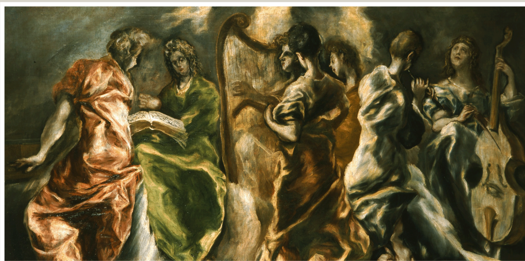
{“el “=>[“Η συναυλία των Αγγέλων”]}, National Gallery - Alexandros Soutsos Museum, Public Domain

20.2% of the 651,083 objects in Europeana provided by Greece are openly licensed . 2.2% is licensed under CC BY-SA and 18% is licensed under CC BY .