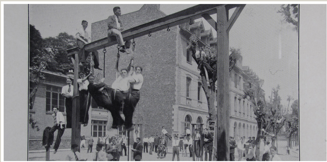
La récréation, Bibliothèque de l'Alliance israélite universelle, Public Domain Marked

14.1% of the 3,942,711 objects in Europeana.eu provided by France are openly licensed . 1% of these objects are shown with the internationally accredited Public Domain mark , 12.8% is licensed under CC BY and 0.3% is licensed under CC0 .