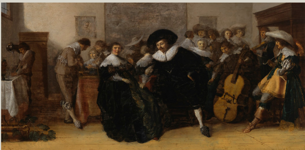
A musical company, Finnish National Gallery, CC0

91.3% of the 1,161,056 objects in Europeana provided by Finland are openly licensed . 46.6% of these objects are shown with the internationally accredited Public Domain mark , 43.6% is licensed under CC BY and 1.1% is licensed under CC0