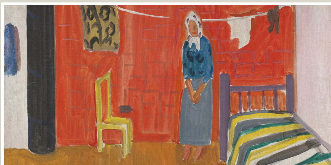
Farmhouse with a Stove | Karl Pärsimägi, Tartu Art Museum, Public Domain

71.9% of the 774,662 objects in Europeana provided by Estonia are openly licensed . 11.7% of these objects are shown with the internationally accredited Public Domain mark , 1.8% is licensed under CC BY-SA , 10.2% is licensed under CC BY and 48% is licensed under CC0 .