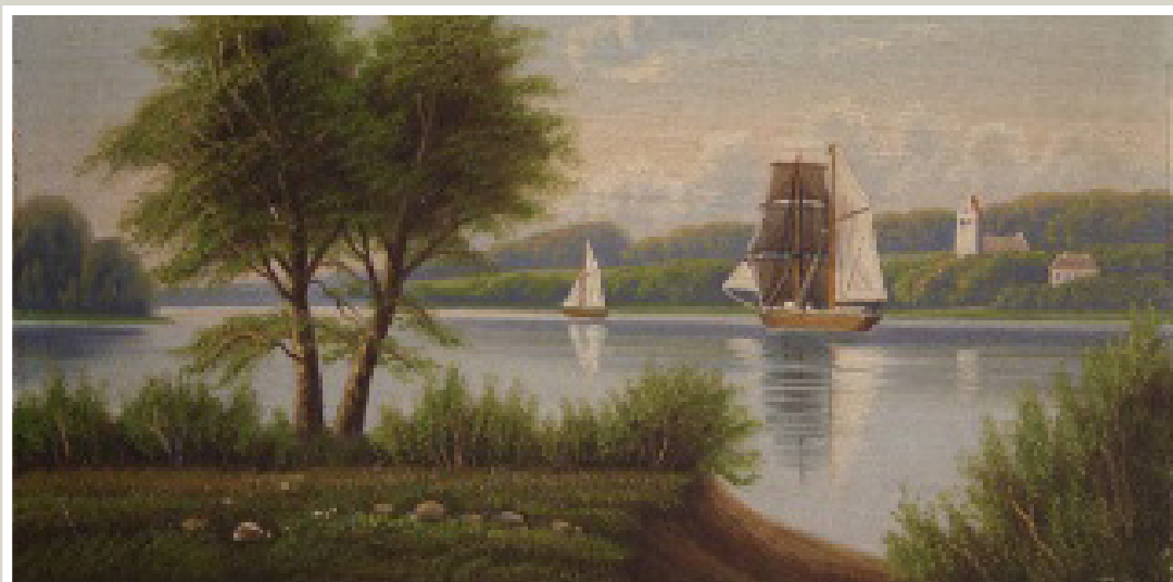
Maleri, olie på pap, Kulturarvsstyrelsen, CC BY

34.1% of the 1,010,870 objects in Europeana provided by Denmark are openly licensed . 18.3% of these objects are shown with the internationally accredited Public Domain mark , 14.6% is licensed under CC0 and 1.3% is licensed under CC BY .