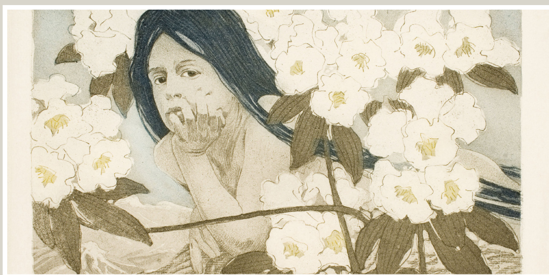
Coloured etchings by V. Preissig, Uměleckoprůmyslové museum v Praze, CC BY

37.5% of the 1,238,462 objects in Europeana provided by Czech Republic are openly licensed . 29.9% of these objects are shown with the internationally accredited Public Domain mark , 3.1% is licensed under CC BY and 4.5% is licensed under CC0 .