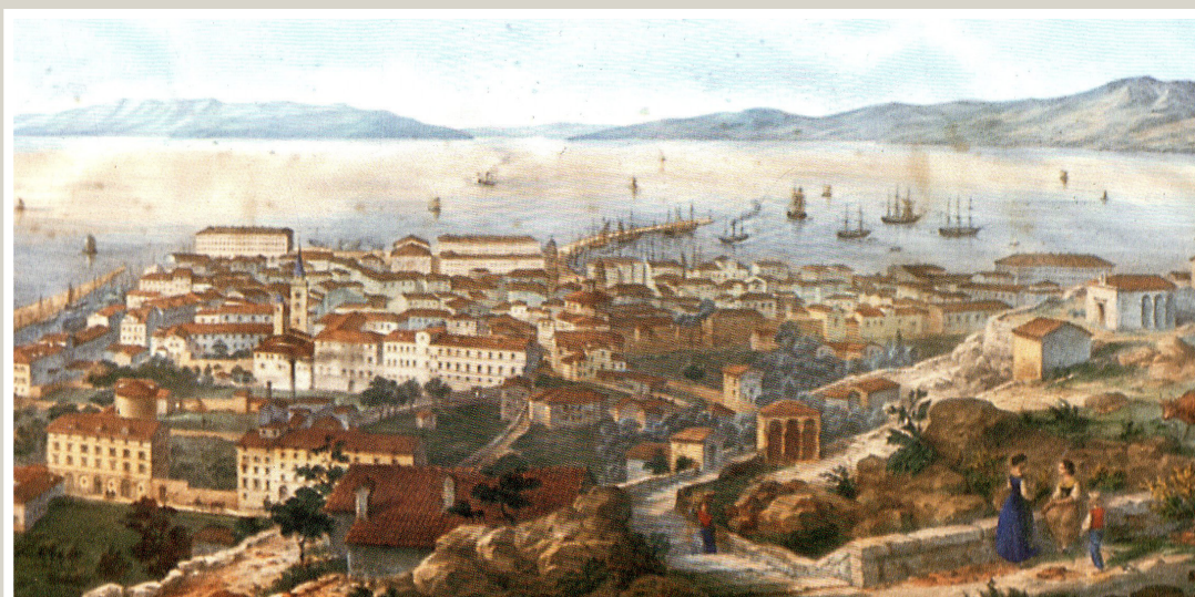
Pogled na Rijeku s bivše Kalvarije.

85.5% of the 158,544 objects in Europeana provided by Croatia are openly licensed . 83.9% of these objects are shown with the internationally accredited Public Domain mark and 1.6% is licensed under CC BY-SA .