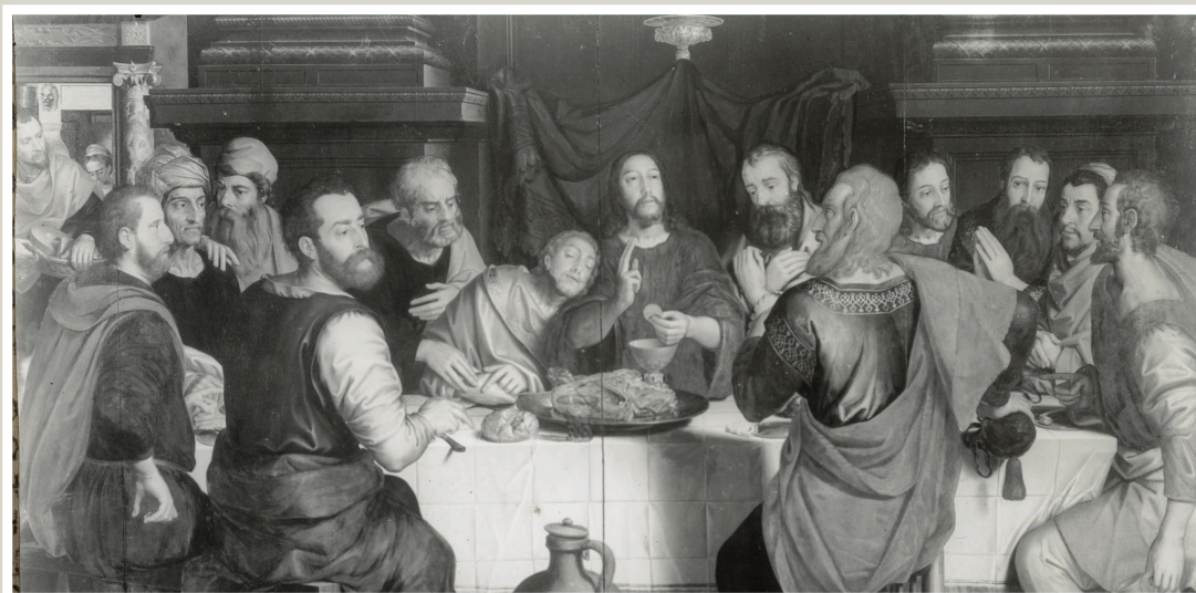
Pieter Pourbus. Laatste avondmaal, KU Leuven, Public Domain

59.4% of the 2,525,874 objects in Europeana provided by Belgium are openly licensed . 1.5% of these objects are shown with the internationally accredited Public Domain mark , 57.5% is licensed under CC BY-SA and 0.3% is licensed under CC BY