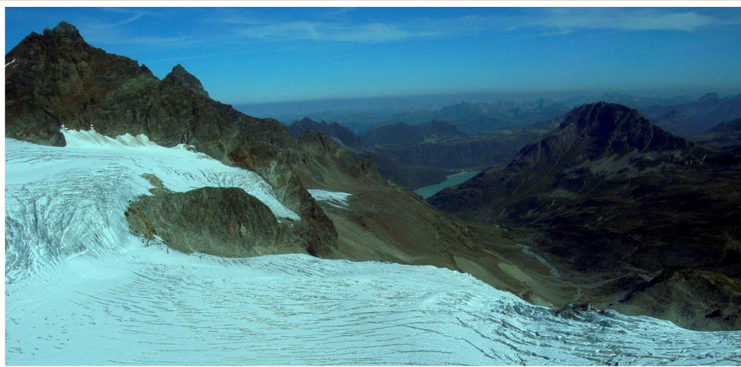
Gaschurn - Silvrettahorn, Ochsentaler Gletscher, Hohes Rad

38.9% of the 2,661,825 objects in Europeana provided by Austria are openly licensed . 22.1% of these objects are shown with the internationally accredited Public Domain mark , 12.3% is licensed under CC BY-SA , 2.5% is licensed under CC BY and 2.1% is licensed under CC0 .