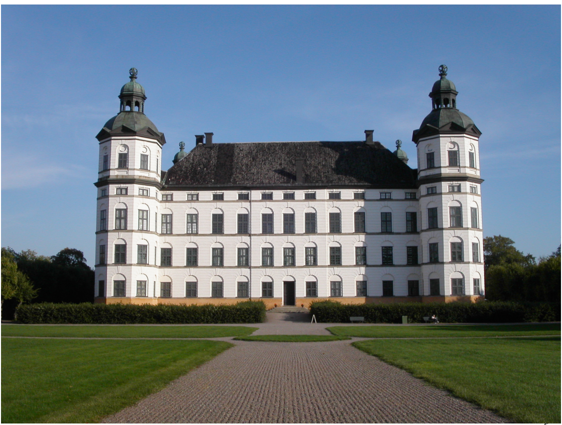
Skokloster Castle, Sweden. By Marcinek (Own work) (CC BY-SA) via Wikimedia Commons.5