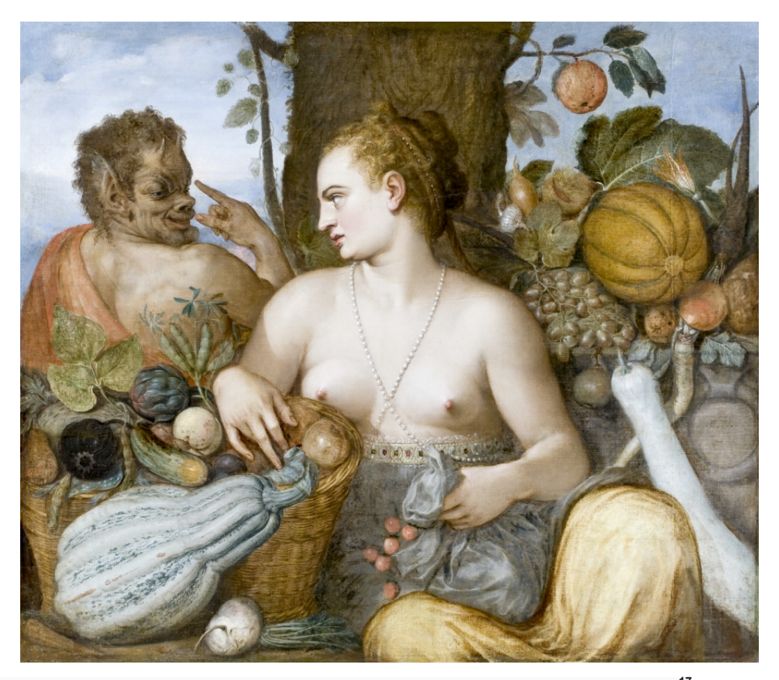
Frans de Vriendt "Floris" – Pomona. 1564. (Public Domain). From the LSH website<sup>17</sup>

it for free. After that, the work is made available as openly as possible for everyone to re-use.