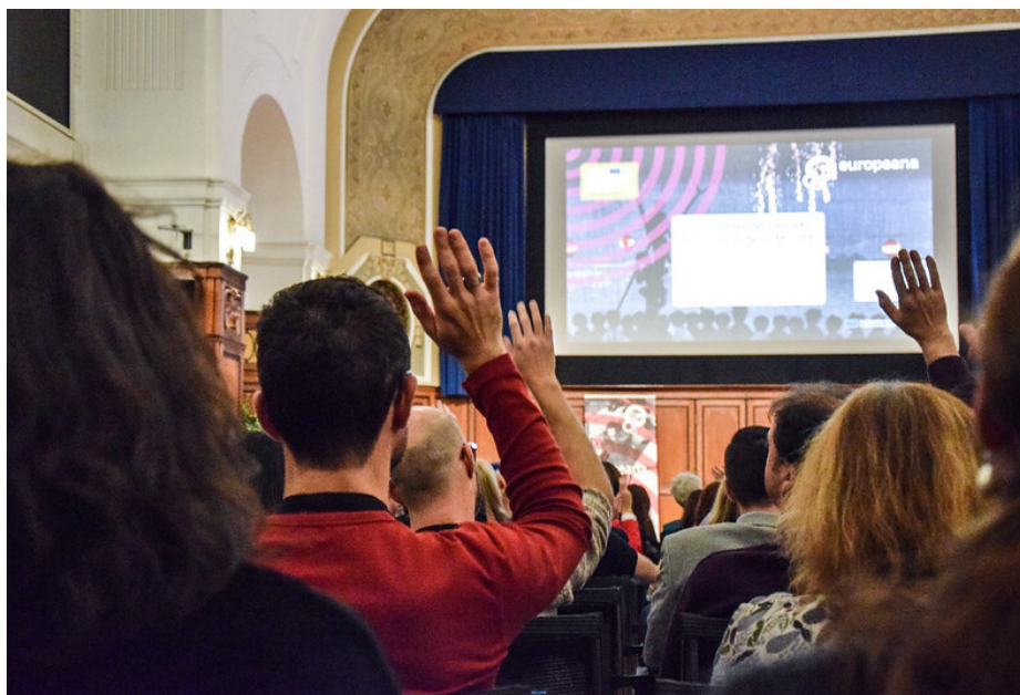
Europeana Network Association AGM 2018

LinkedIn, Twitter and in the Network Update, as well as several dedicated campaigns via email and Mailchimp.